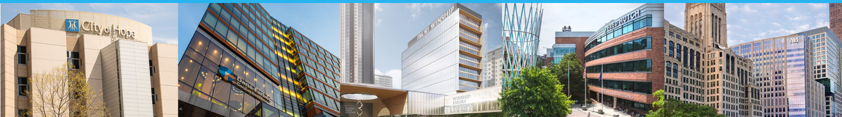
City of Hope